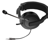
LEMO professional moving-coil side ear headset:5pcs