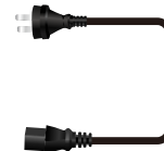
AC Power Cable:1pcs