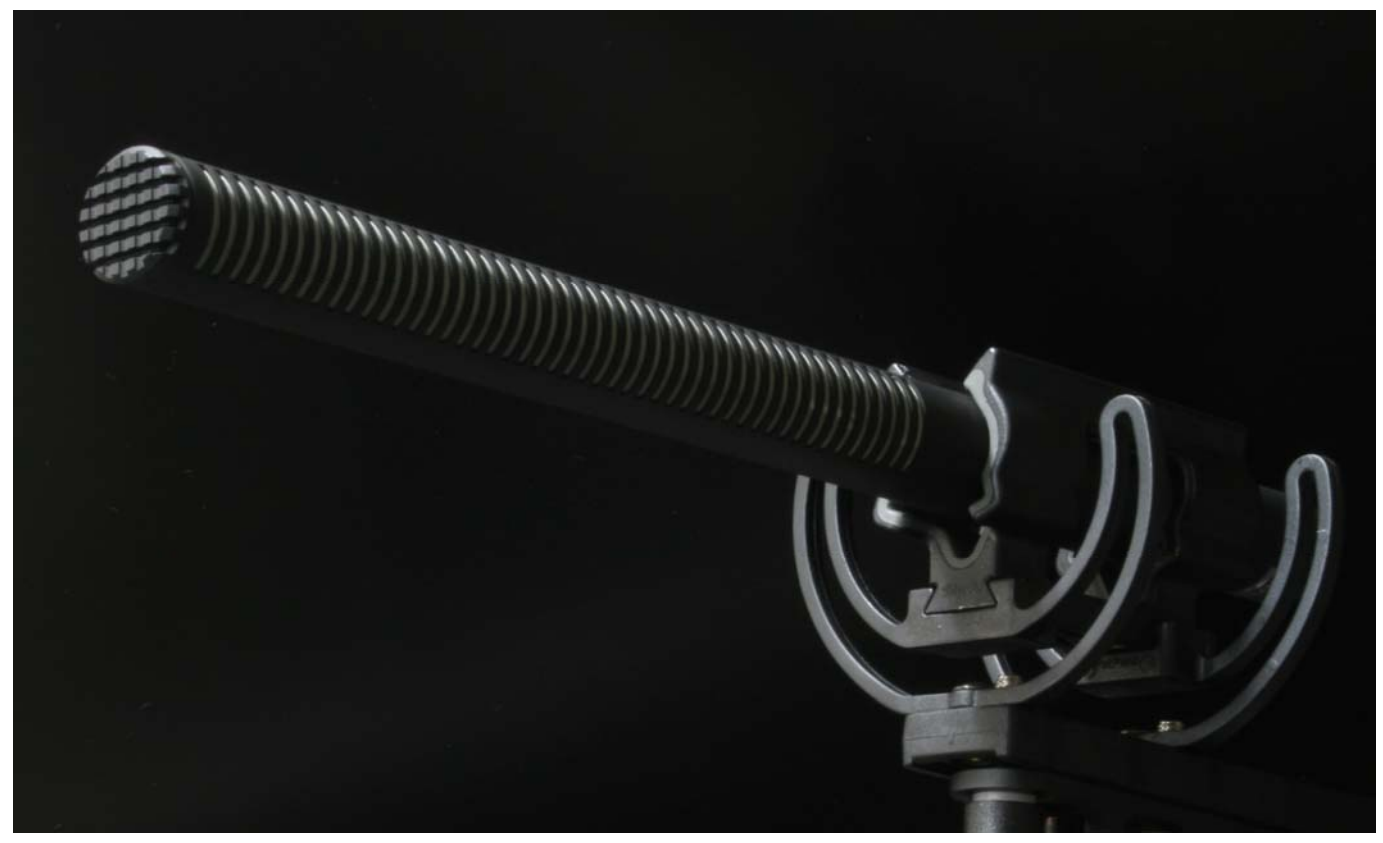
The suspension handgrip is an optional accessory.