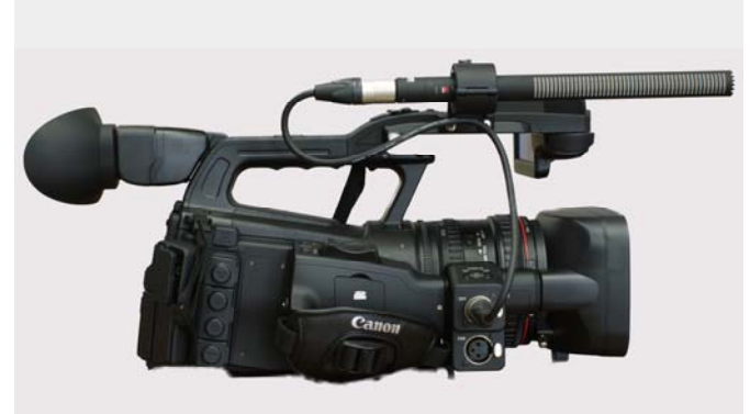
Mounted on Canon XF305