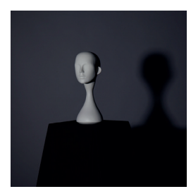
Zoom Reflector at zoom