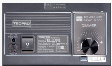
STANDARD DIMMER (1)

Manual operation of dimmer included with the light head.