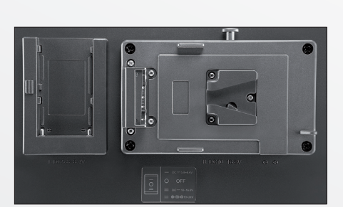
Types of Battery Mounting

Manual operation of dimmer included with the light head.