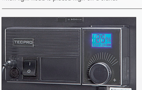
DIGITAL LCD DISPLAY

Dimmer connected with cable is easier to use when light head is placed high on a stand.