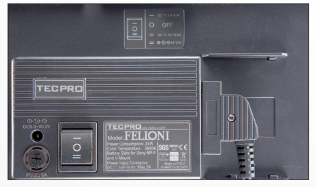
DIMMER CONNECTED BY CABLE

Power supply options included in each Felloni standard package: V-Mount for camera batteries, also for new AC adapter; NP-F battery shoe, DC external input 10-16.8 V.